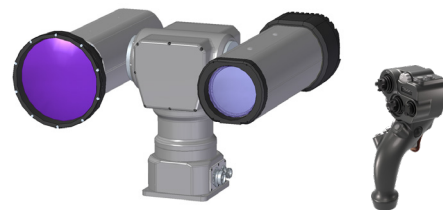
PTU-M usage example